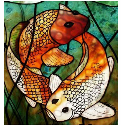
Figure 1: Koi (2006) detail.

With one variation of the technique, you can enhance the appearance of a lead line by giving it an interesting contour. For example, the join could look like a craggy branch or twig (figure 4), or a rose stem might have thorns (figure 5). Use an extra wide