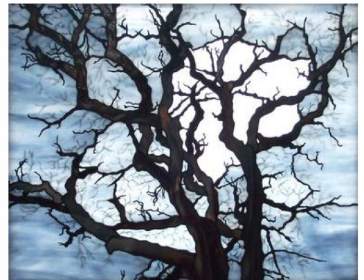
Figure 7: Small overlays make up Oak Tree (2008).

In the Oak Tree panel (figure 7), you can see examples of these techniques. The contours