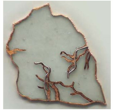
Figure 9: Reinforcing an overlay with brass wire.

I used it for the filaments (parts of the stamen). The anthers are copper foil. They are initially stuck to the glass, but I rely on the wire filaments to hold them in place. In Barque (figure 11), the rigging is fine copper wire. I made the rope ladders before attaching them to the panel.