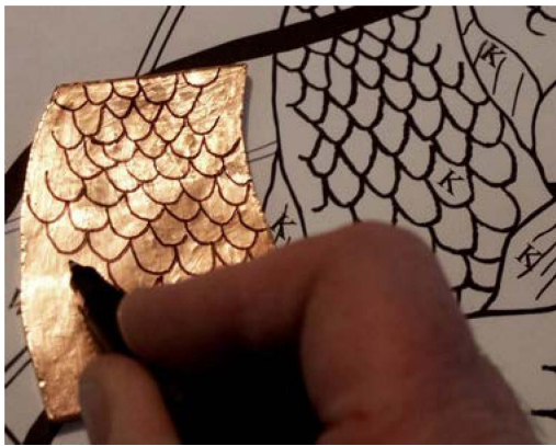
Figure 2: First draw the design on the copper foil.

A copper foil overlay is a thin layer of copper, shaped as required and stuck to the surface of the glass. There are several ways of using this technique. Here are the basics: you can use regular copper foil in tape form for relatively straight lines, and sheet foil (which usually comes in 12" square pieces) for more complex shapes. The foil is applied to each separate piece of glass, before they are assembled in the panel, and the overlay is cut to shape after it is stuck down. It is important to ensure that the foil adheres well to the glass surface, so clean and dry the glass thoroughly, and rub the foil down well. When you design the overlay, try to ensure that it will meet the edge of the glass piece in at least one place. This helps to secure the overlay to the glass surface. After applying the foil, wrap the edges of the glass with copper foil, in the usual way, trapping the overlay wherever it meets the edge. Draw the shape of the overlay on the foil, and cut away surplus copper foil with a craft knife or razor blade (see figures 2 and 3).