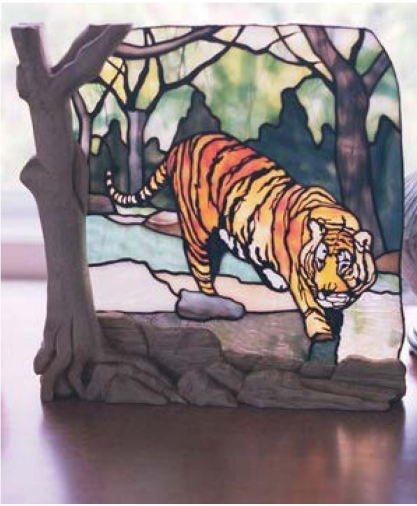
Figure 8: In Tiger (1998) some of the stripes are overlays, and some are enhanced joins.

I used it for the filaments (parts of the stamen). The anthers are copper foil. They are initially stuck to the glass, but I rely on the wire filaments to hold them in place. In Barque (figure 11), the rigging is fine copper wire. I made the rope ladders before attaching them to the panel.