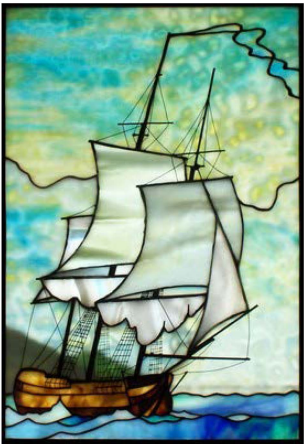
Figure 11: In Barque (2008) the rigging is fine copper wire.

If you are working on small overlays, such as the twigs in Oak Tree (figure 7), it is usually sufficient merely to make sure that the iron does not dwell in one spot – keep it moving, do the job quickly.