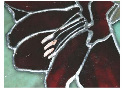
Figure 10: Stamen made with wire and copper foil, from Amaryllis.

Hold the foil down with a small piece of wood, such as a tooth pick, while you solder, and press it down again when the overlay is cool – it should re-stick. If it is still loose when the panel is finished, apply a little glue. Glass can crack if it is heated unevenly. This happens most frequently if you are working on an overlay, with the soldering iron, in the middle of the piece of glass.