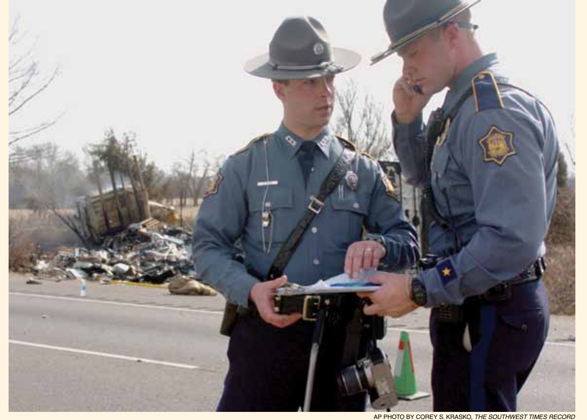
Two Arkansas state troopers look over an accident reconstruction sketch in 2008. Another trooper was killed in the accident.

Open records law in New York derives from the state's Freedom of Information Law ("FOIL").