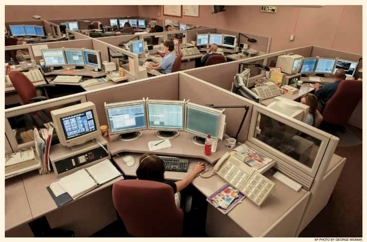
Dispatchers work inside a 911 call center in Manheim, Pa. Recordings of the calls are often only released if police think there will be a benefit in doing so, although in many states they will not be released at all.

nal Justice Information Center's proposed changes to the Law Enforcement Officers' Handbook state that a law enforcement agency may redact information from Alabama Uniform Incident/Offense Reports that "would reveal investigatory techniques." See ACJIC, Law Enforcement Officers' Hand book , Part III (proposed changes) (October 2005), available at http://www.alabamapress. org/alapress/forms/LEOfficersHandbook. pdf.