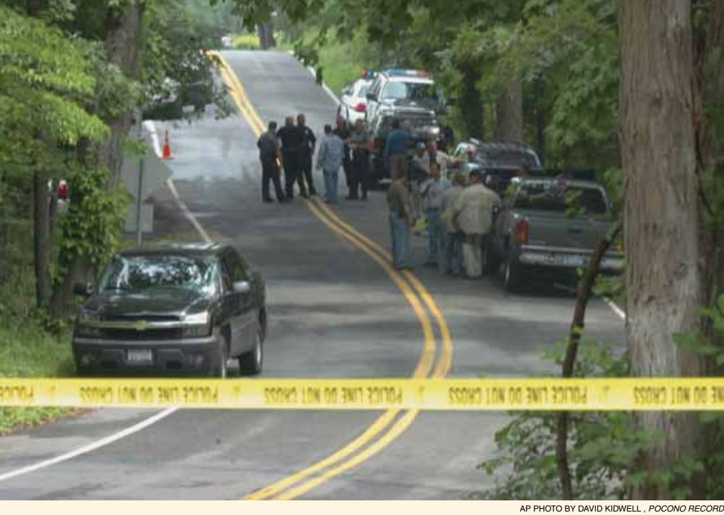
Journalists rely on access to the records created during police investigations and other information gathered from crime scenes to report on important stories.

Open records law in California is represented by statute primarily through the California Public Records Act ("CPRA"),