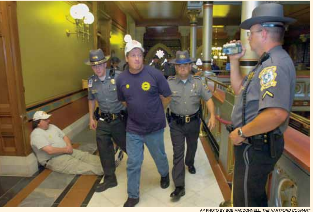
Universal health care protesters were handcuffed and arrested in front of the Conn. governor's office in the State Capitol in 2007.

Records revealing police techniques may be closed. See Op. Att'y Gen. Sept. 7,