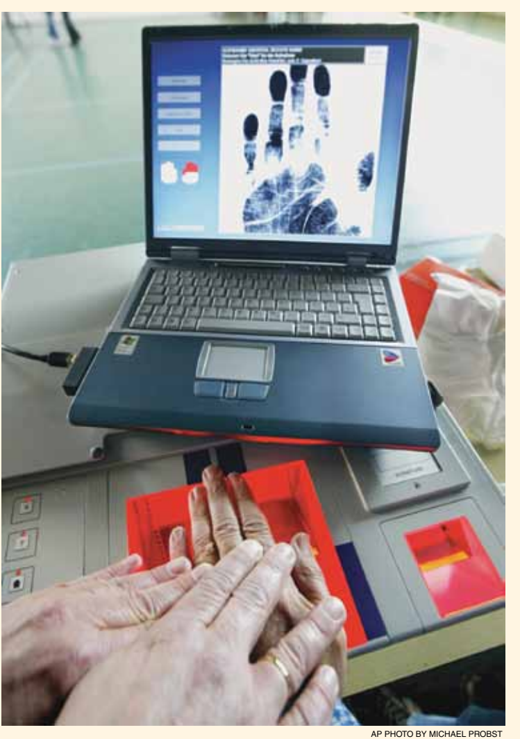
tial informants is exempt if Information from active investigations can be withheld under the disclosure would con- most state open records acts.

lic inspection certain criminal intelligence and investigative records and files. Fla. Stat. sec. 119.07(3)(f). The police investigative/ intelligence records exemption only applies when such records are active. Fla. Stat. sec. 119.07(3)(b). Criminal intelligence/investigative information is considered to be "active" while such information is directly related to pending prosecutions or appeals. Fla. Stat. sec. 119.011(d). Once the conviction and sentence have become final, the exemption no longer applies. State v. Kokal, 562 So.2d 324 (Fla. 1990). Records disclosed to a criminal defendant are not exempt as investigative or intelligence information. Fla. Stat. sec. 119.011(3)(c)(5).